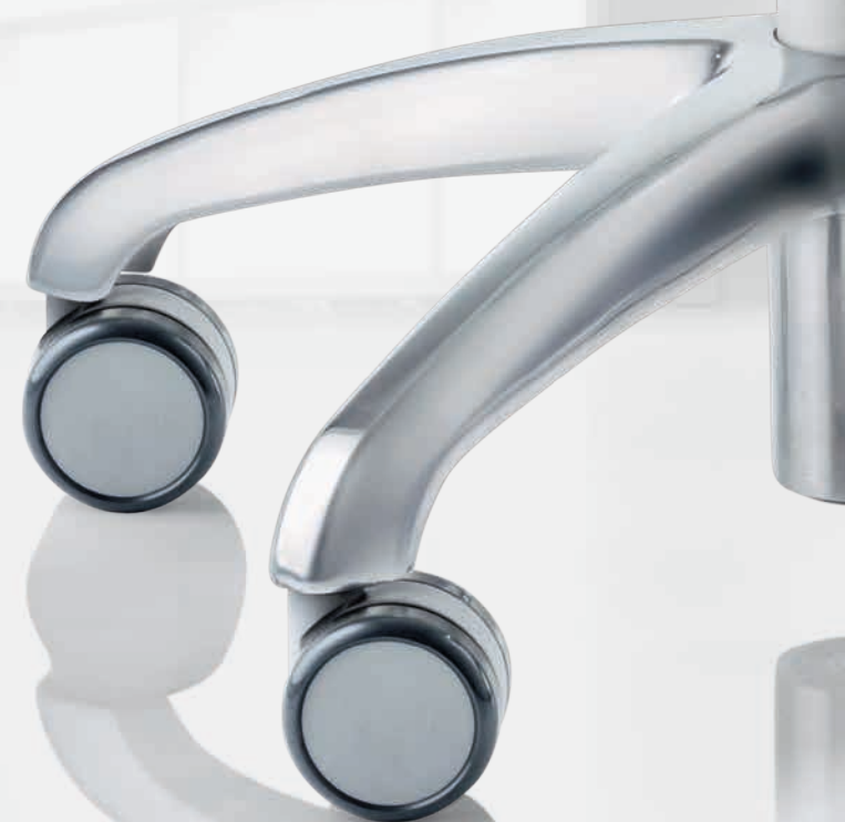
An extremely lean base for plenty of freedom of motion and soft, braked castors for controlled rolling motions.